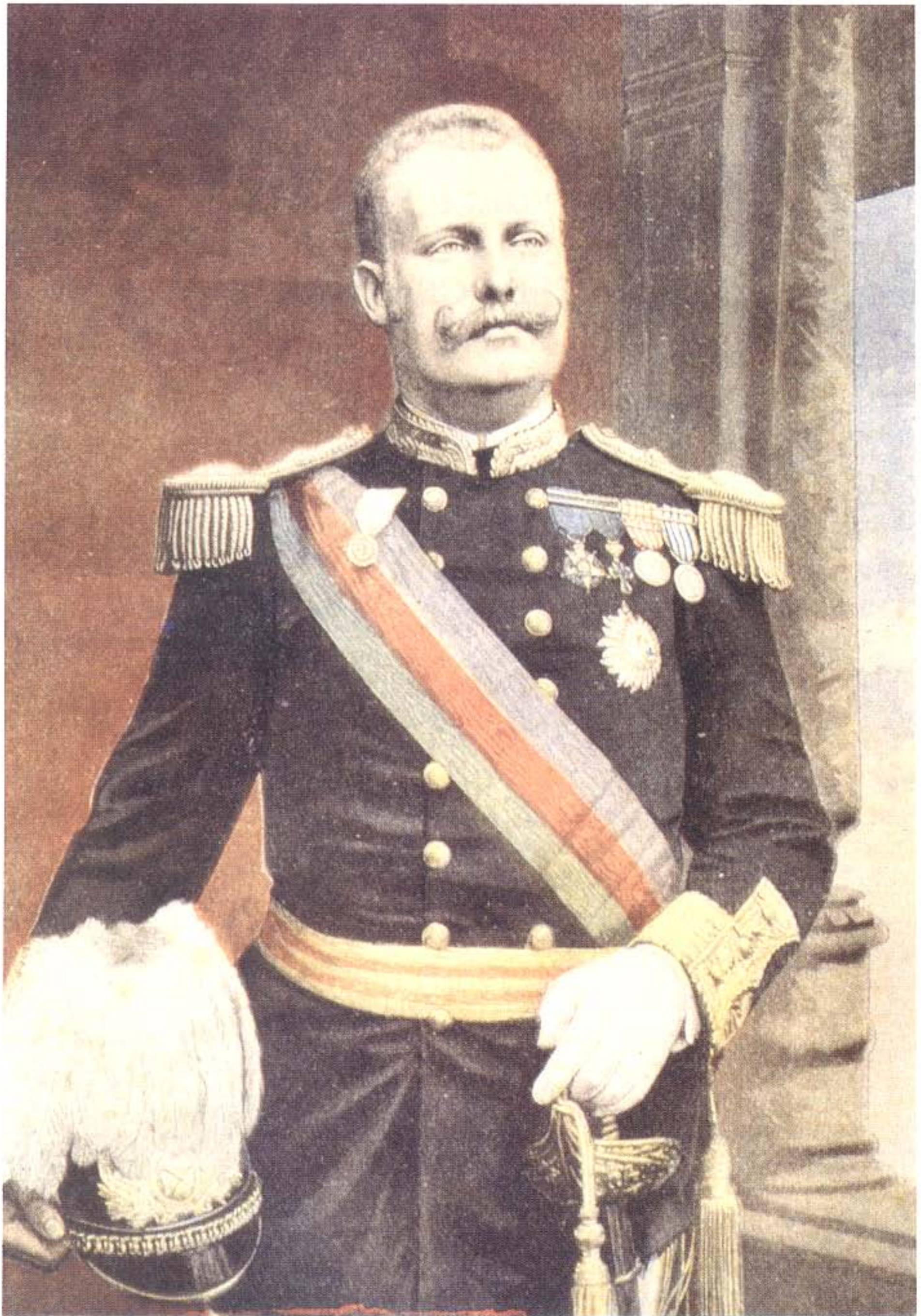
King Carlos de Bragança